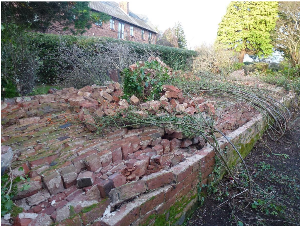
The collapsed wall in Reynolds Park, see page 6.