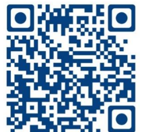
WS QR code