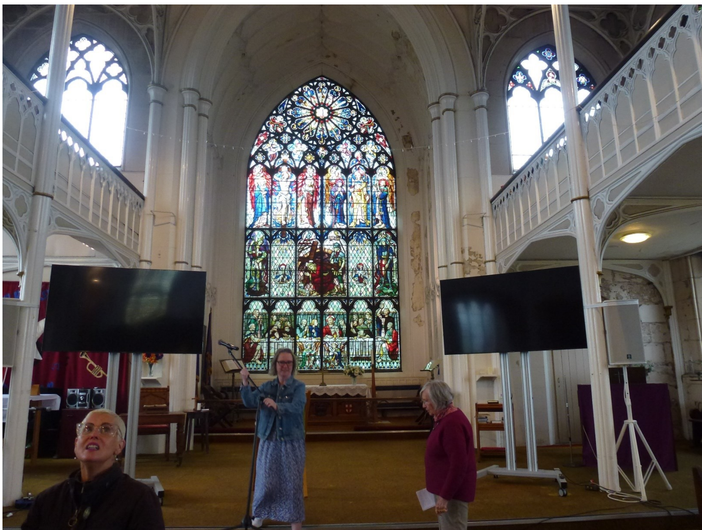
The interior of St George's church during the visit by society members in July 2024.

The address is Heyworth Street, Everton L5 3QG