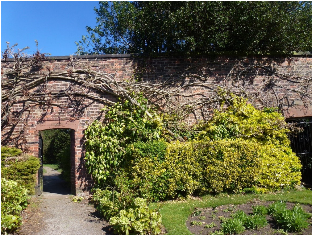
The walled garden in the April sunshine.