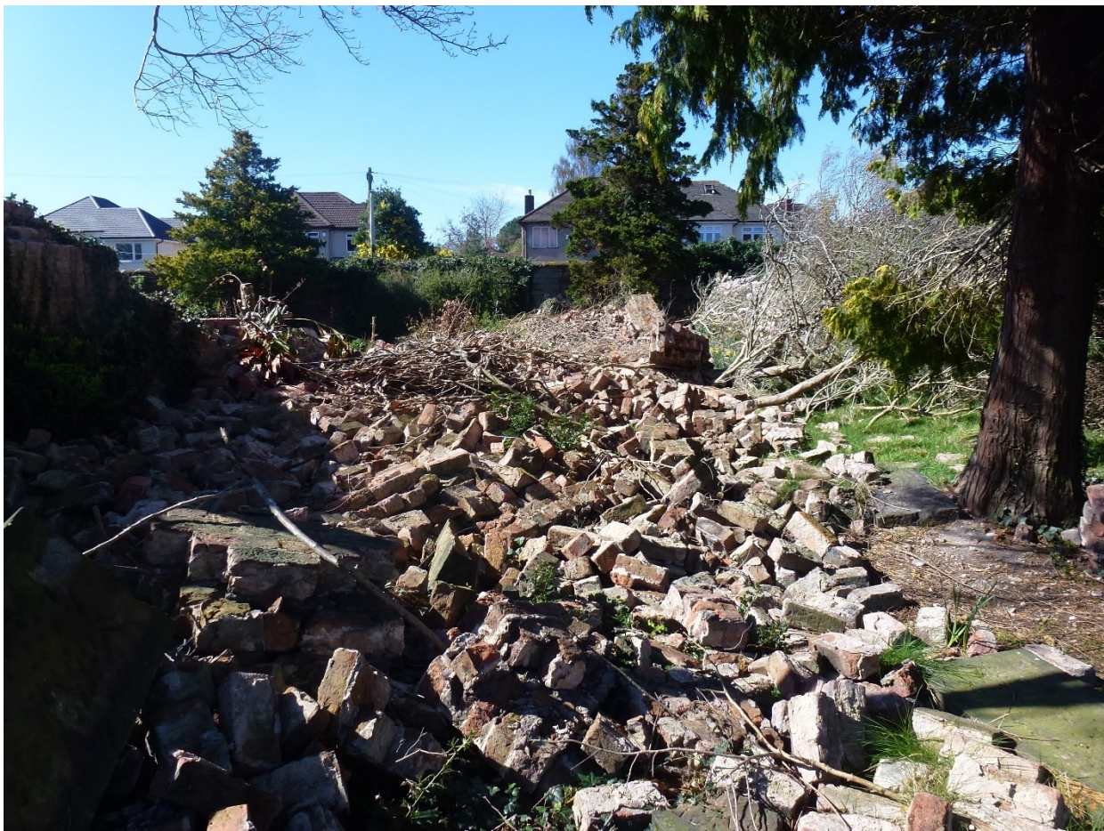
Rubble still in place outside the walled garden.

For the past three months the walled garden has been more like the secret garden, as it has been accessible by only the gate in the corner which is not always open. It is fortunate that the gardeners have been able to access the site by way of their goods entrance on Church Road. An image of the garden is on the cover of this issue.