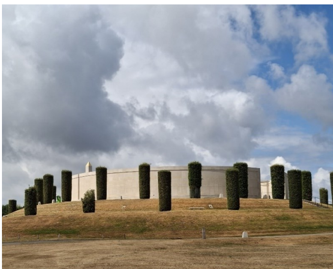
The Armed Forces Memorial