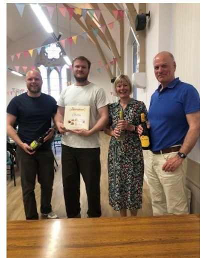
The King Quizzers