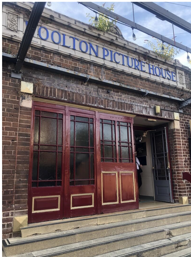
Woolton cinema to re-open? See page 5