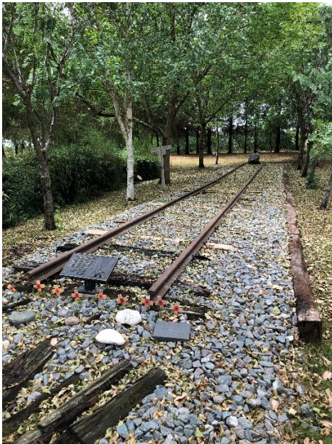
A section of the Burma-Thailand WW2 railway