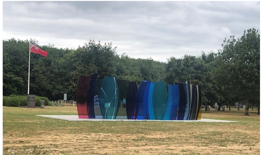
The merchant navy memorial