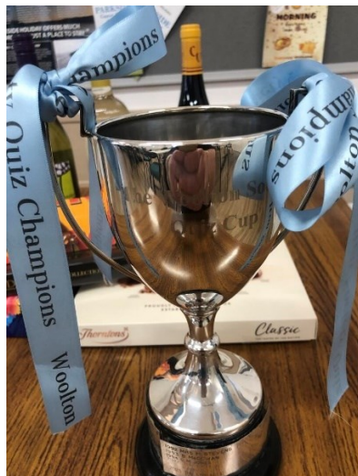
The quiz trophy