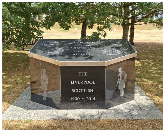
The memorial to the Liverpool Scottish regiment.