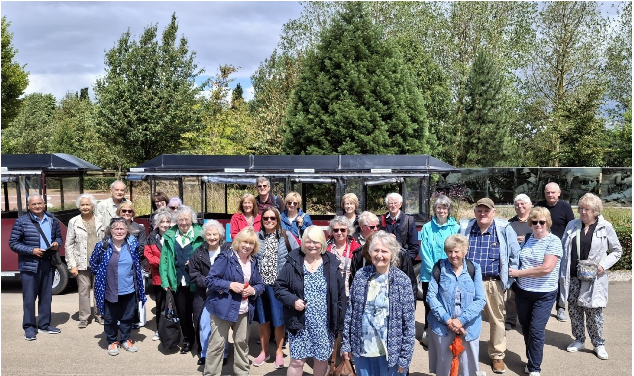
The Woolton Society group by the land train

The National Memorial Arboretum in Staffordshire saw the society's annual day out this year. Leaving Woolton at 9.30 & arriving at the Arboretum soon after 11.30 we had time to view the indoor exhibition before boarding the land train at 12.30. This gave a 45 minute tour of the 150 acre grounds, with a commentary giving detailed explanations of the over four hundred memorials around the site. Afterwards we were free to explore, with many taking in the guided tour of the Far East Prisoners of War section. With refreshments provided, the homeward journey passed very quickly, with arrival back in Woolton at 6.45 pm. A good time was had by all, with the arboretum being highly recommended as a day out.