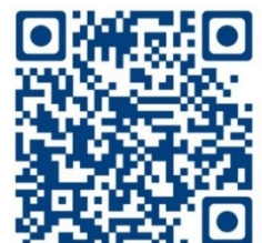
WS QR code